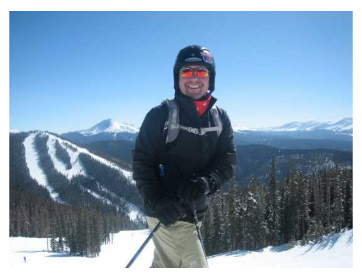
Resort Skiing – Top of Empire Bowl-Deer Valley – Park City, Utah