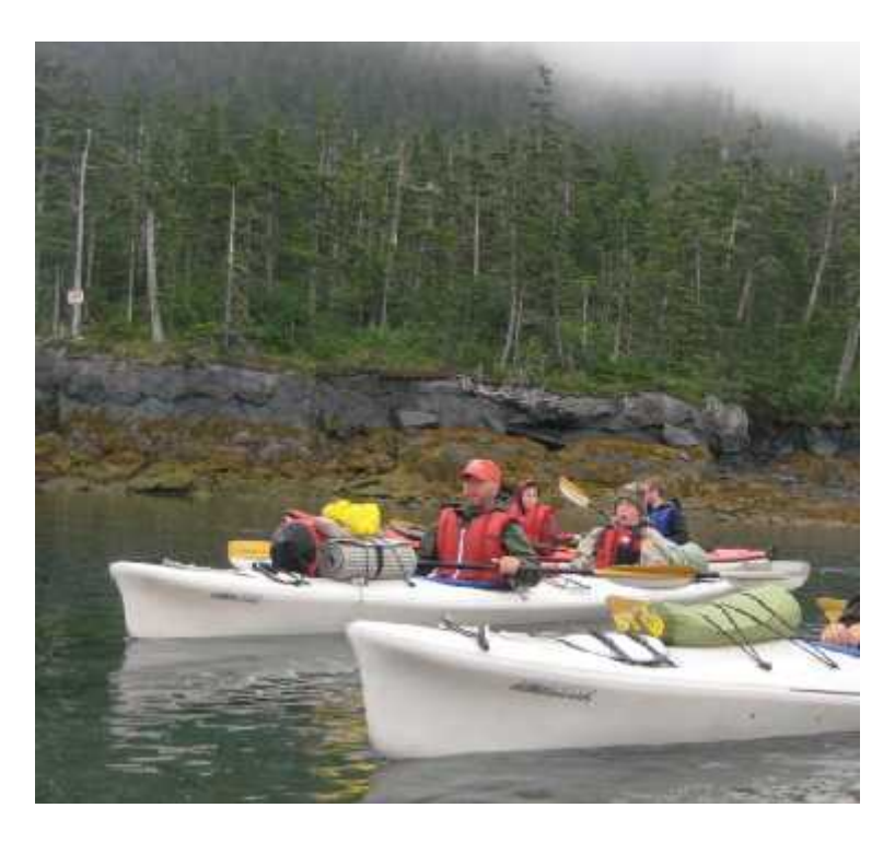
Scouting – Sea Kayaking on Prince William Sound – Whittier, Alaska