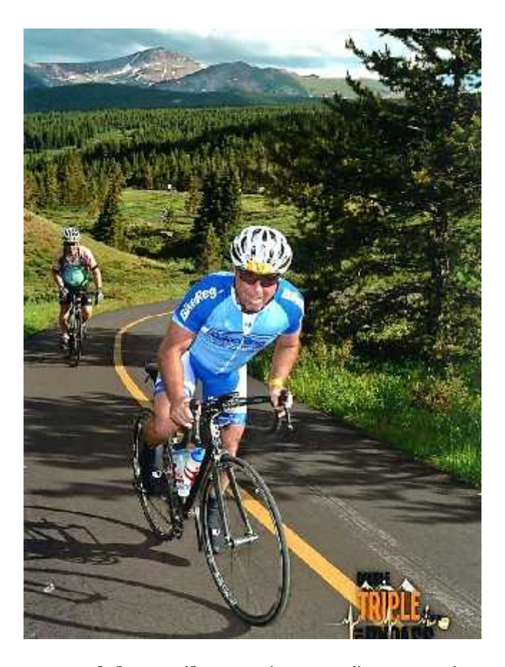
Cycling – Top of the Vail Pass (11,600') Summit County, CO