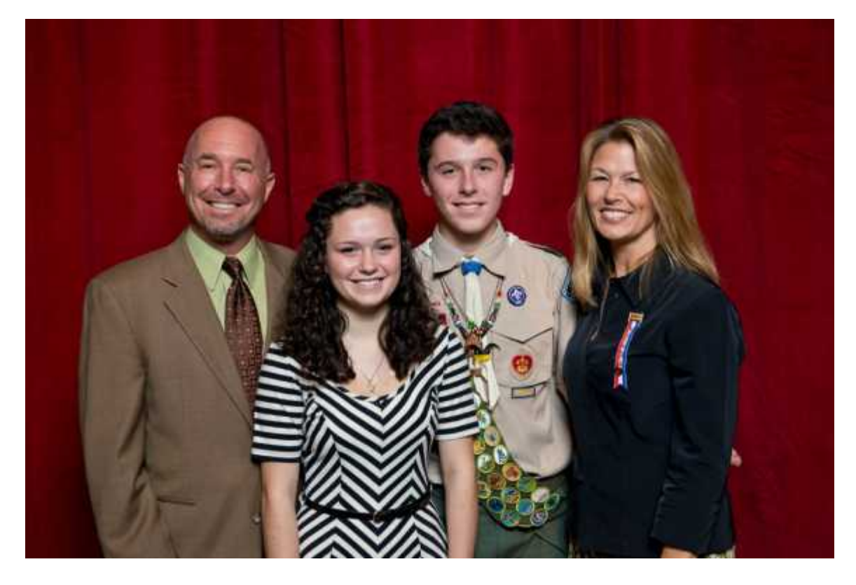
Family (Eagle Scout Awards Ceremony)