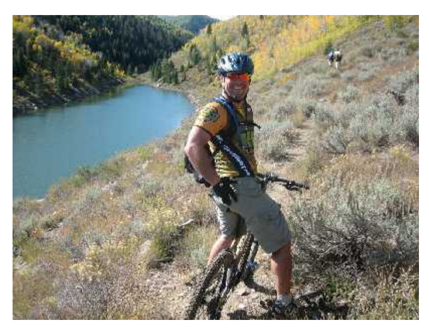
Cycling – Strawberry Mountain (8,500') Wasatch County, Utah