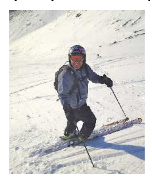
Back Country Skiing - Top of Peak 3-Chugach Mountain Range (3,500') Anchorage, Alaska