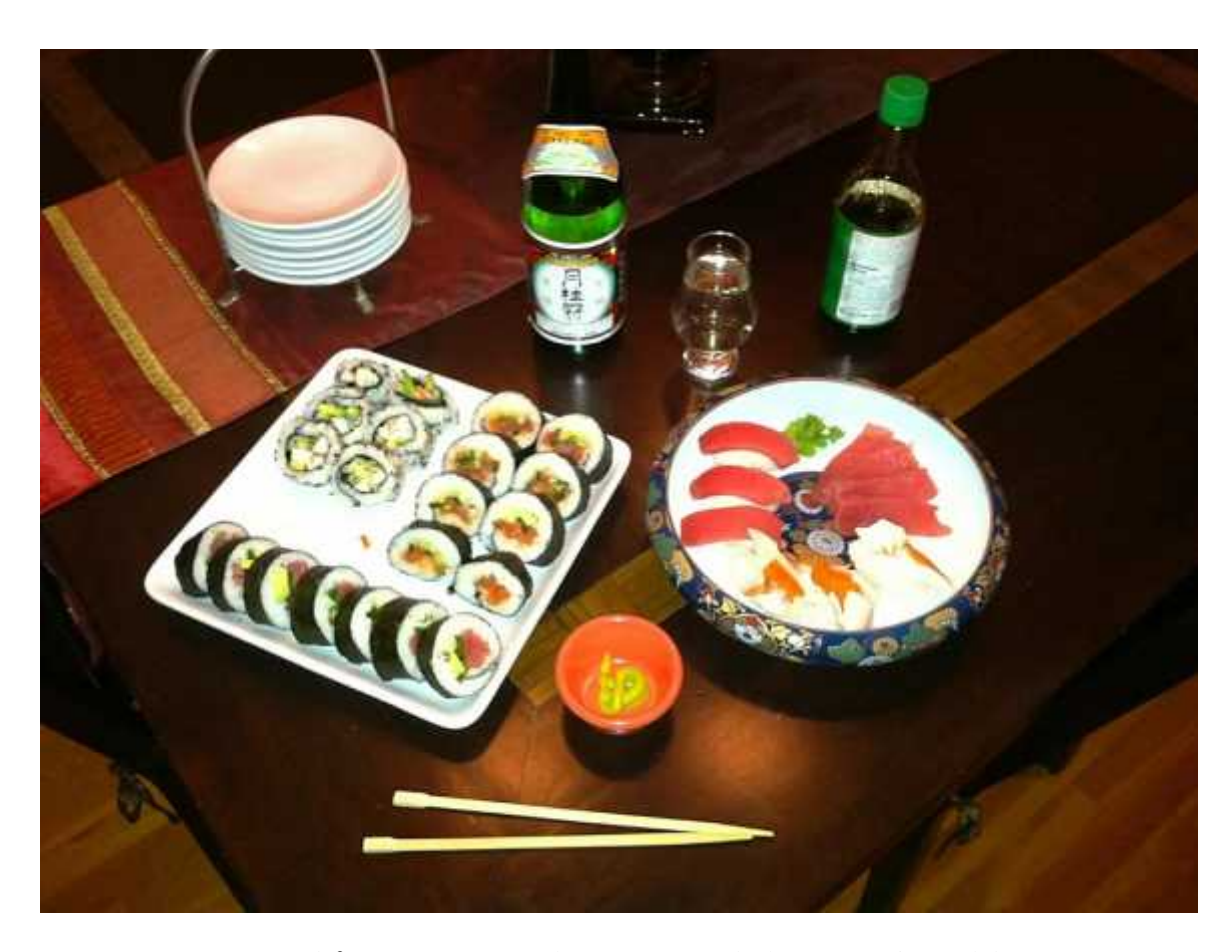
Cooking – Recently mastered the art of Sushi