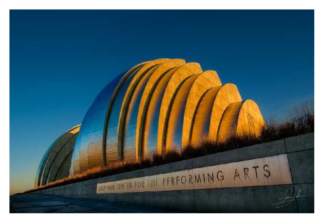
The Arts – Music, Theater & Dance – Kansas City, MO