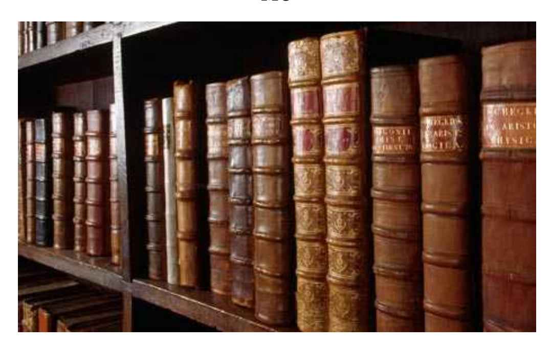
Reading – Historically Based Fiction, Biographies, Self-Improvement, Thrillers – Wherever I am, every day