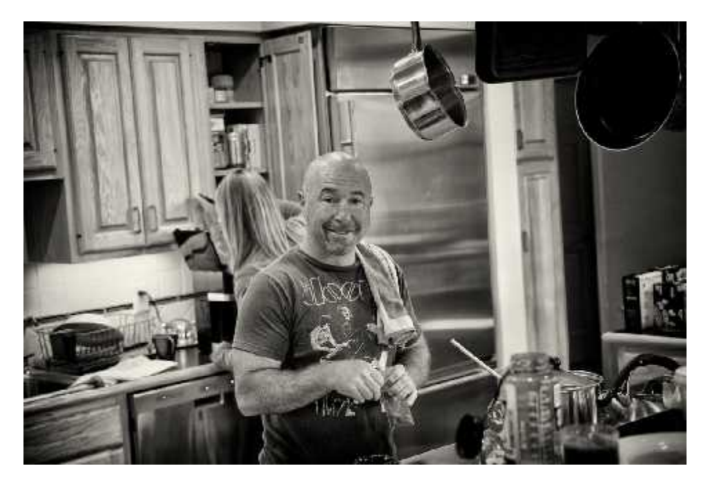
Trained Chef – Preparing the pre-race meal – Beaver Creek, CO