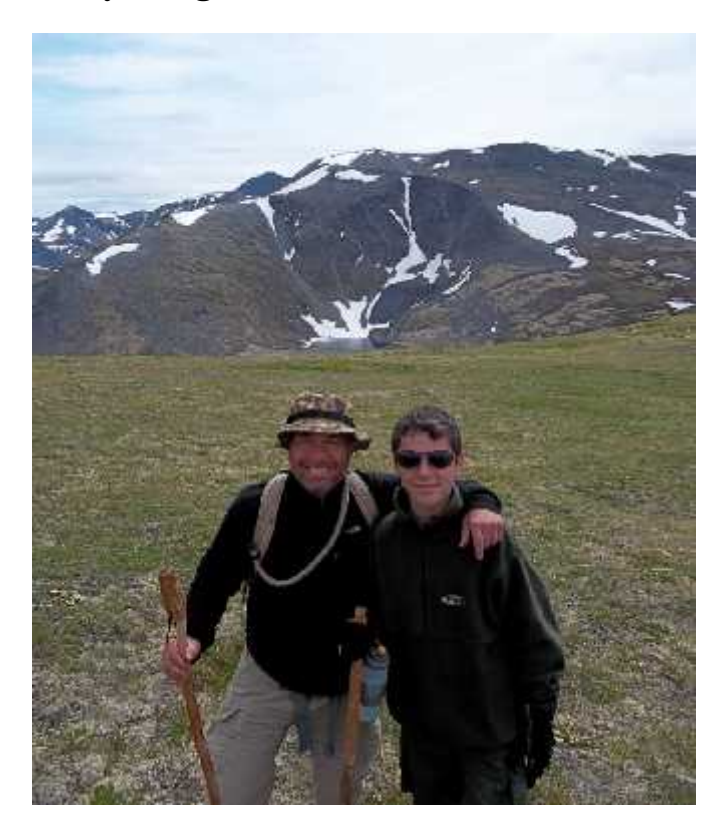
Scouting - Backpacking the Resurrection Trial - Hope, Alaska